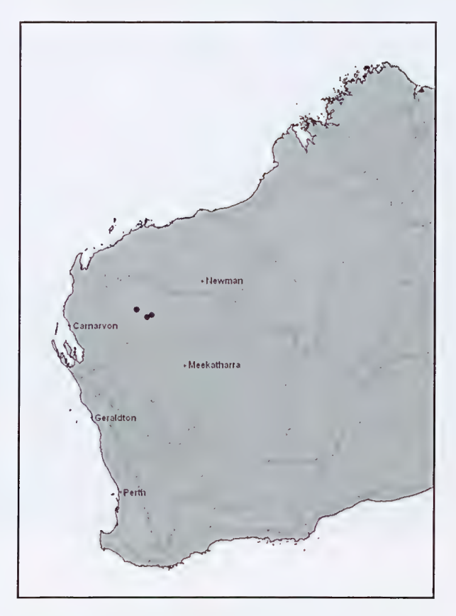
Figure 2. Map of Western Australia showing the distribution of Wurmbea fluviatilis and IBRA Bioregion boundaries.

Conservation status . Listed as Priority Two under the Department of Environment and Conservation (DEC) Conservation Codes for Western Australia under the phrase name Wurmbea sp. Thomas River A. Case & B. Cole 58 (Smith 2010; Western Australian Herbarium, FloraBase , 1998–, accessed Nov. 2010). Only three localities are known despite some effort in seeking further localities, although only sites easily accessible by road have been examined to date. Whilst other locations may well exist, the